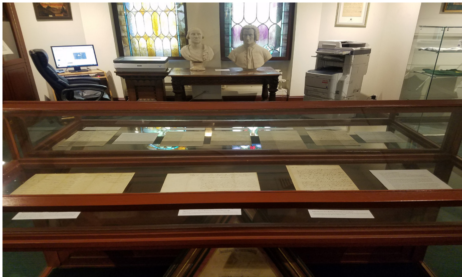
The Grand Lodge Correspondence Collection Exhibition

At the end of April 2022, the rehousing project of the Grand Lodge Collection was complete. In the process of completing the Collection, I drafted a basic finding aid of the Collection. This finding aid will be used for staff reference, but when it is revised, it will be uploaded to the Library's website for patrons' reference.