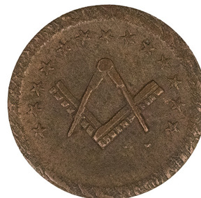
Civil War store card used at W. Alenburg Meat Store located on 622 Central Avenue, Cincinnati, Ohio

To see these tokens in the Library's Online Museum, use the links below: