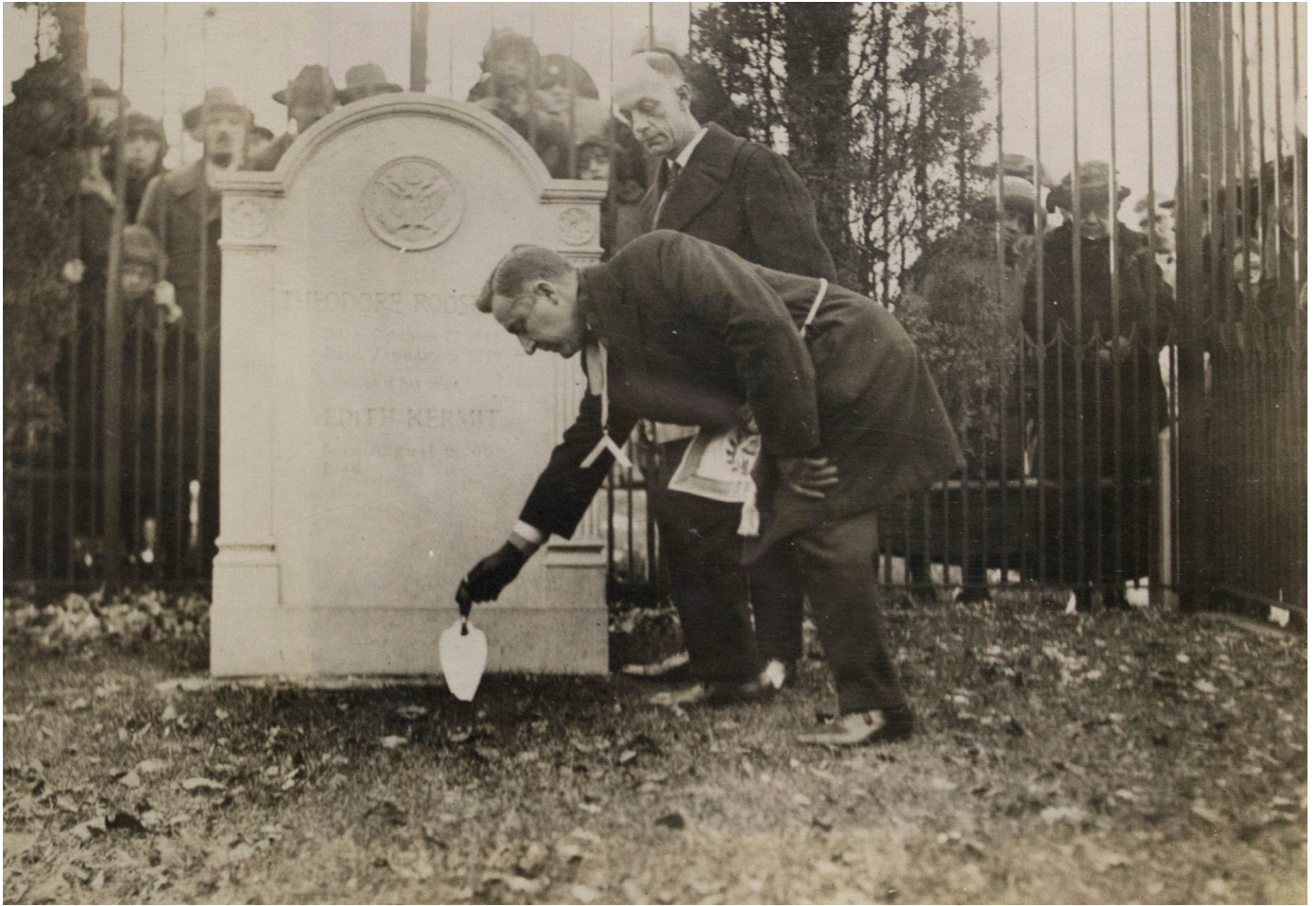
The trowel was used for a Masonic ceremony at Theodore Roosevelt's grave by Matinecock Lodge No. 806.

The Trowel eventually celebrated its homecoming to Justice Lodge on December 4th, 1923. The Trowel's entire journey took 22 years and almost 20,000 miles. After the homecoming, the Trowel still visited a few more lodges until 1936. With the courtesy of Justice Lodge, the famous Traveling Silver Trowel has become part of the Chancellor Robert R Livingston Masonic Library and Museum collection.